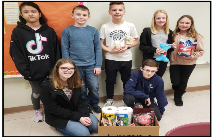
Seventh grade students collected items for the local animal shelter.