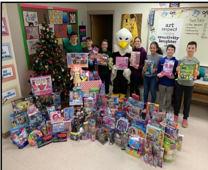
VMS students display toys donated by elementary and middle school students.

*Teacher's note: These examples provide only a few snapshots of the compassion and giving evidenced throughout our school. Valley students should feel proud for their part in creating memorable experiences for the good of many.